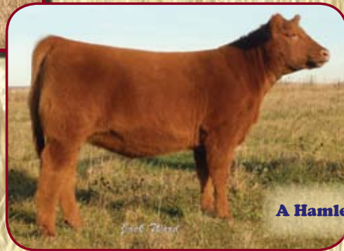
A Hamley daughter

BW: +0.5 WW: +49 YW: +84 Milk: +10 TM: +35 CED: +6.0 CEM: +5.0 Stay: +6 HPG: +6 REA: -0.6 Marb: -0.19 Fat: -0.01