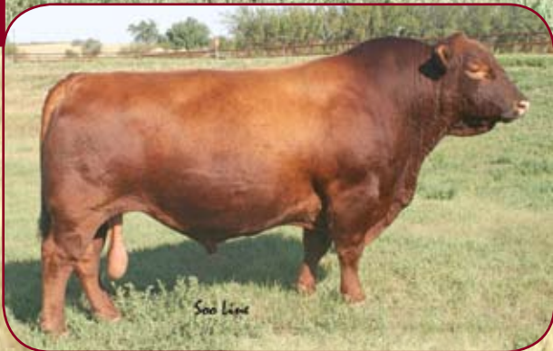
Son of Lot 228 Red Dwajo Gladiator 32L

Red Dwajo Superior 4H was one of the best. A direct Prime Rib 411 daughter whose every son raised at Dwajo entered herd bull duties, including All Star 10T the $26,000 Masterpiece purchase by Double Bar D. Superior 4H, an in dam purchase from Red Round-up, also produced the $9,000 Red Round-up '05 high selling heifer calf, Red Dwajo Superior 115S who has 2 embryos sired by Red Fine Line Mulberry 26P selling as Lot 228. The Superior cow family could be considered one of the best Red Round-up purchases as well as a success story in raising the great ones.