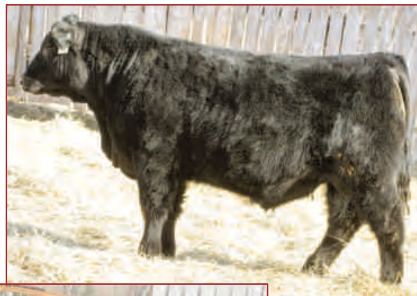
EASTONDALE TRADITION 92'11 LOT 92Y