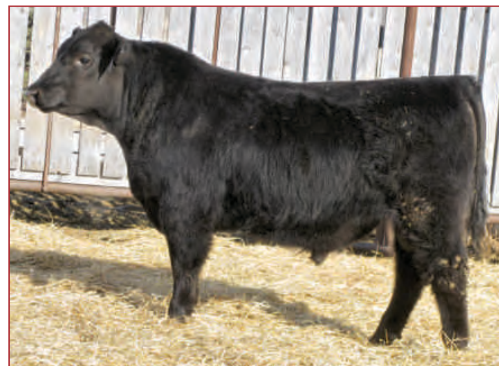
EASTONDALE DURATION 27'11 - LOT 27Y