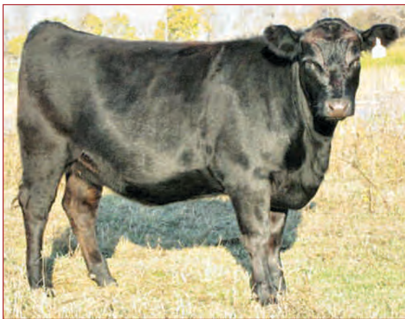
TYPICAL EASTONDALE RIGHT TIME 62'03 DAUGHTER