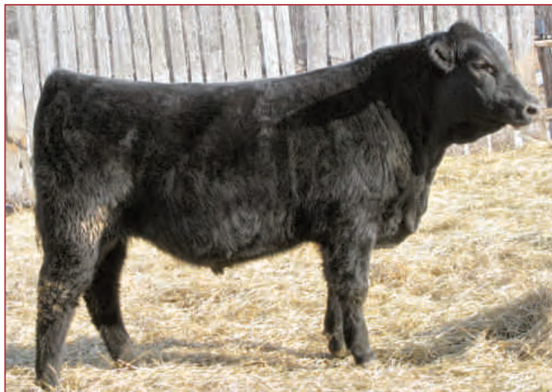
OAKWOOD RIGHT TIME 1Y - LOT 1Y