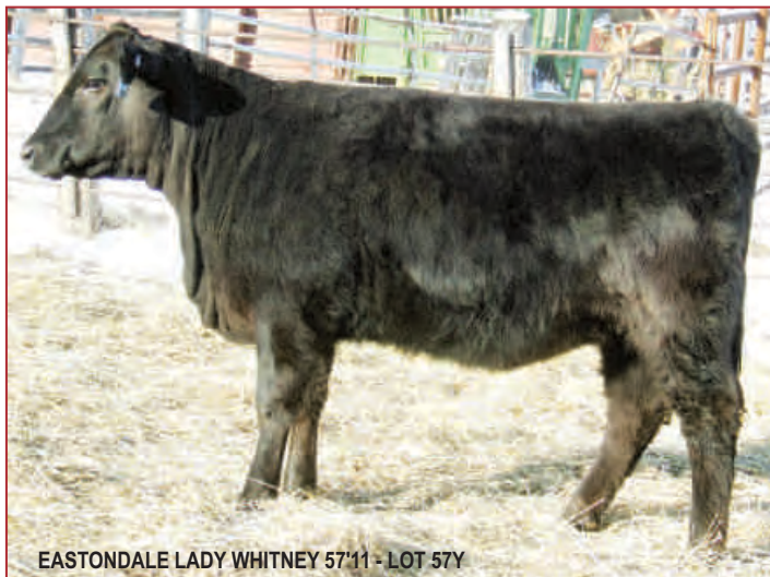
EASTONDALE LADY WHITNEY 57'11 - LOT 57Y