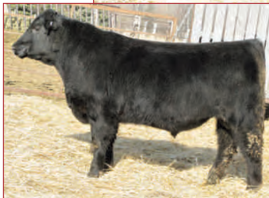
EASTONDALE TRADITION 112'11 LOT 112Y