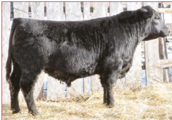
EASTONDALE DURATION 21'11 - LOT 21Y