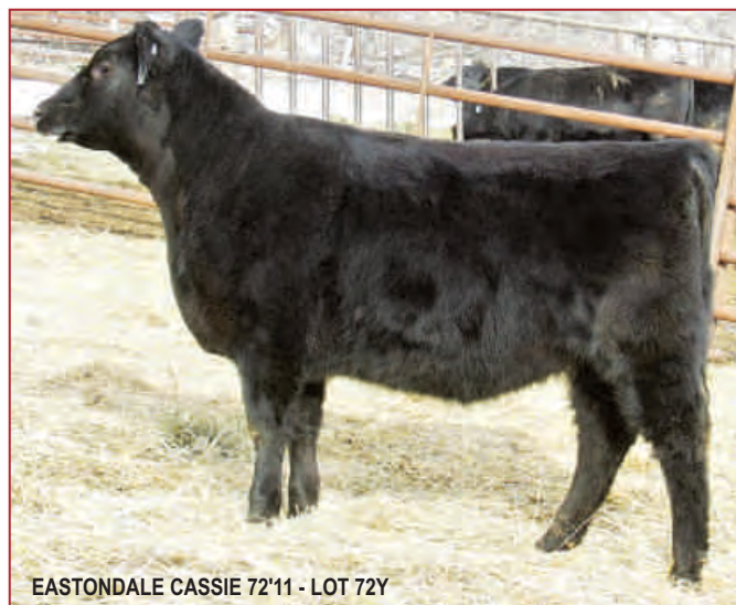
EASTONDALE CASSIE 72'11 - LOT 72Y