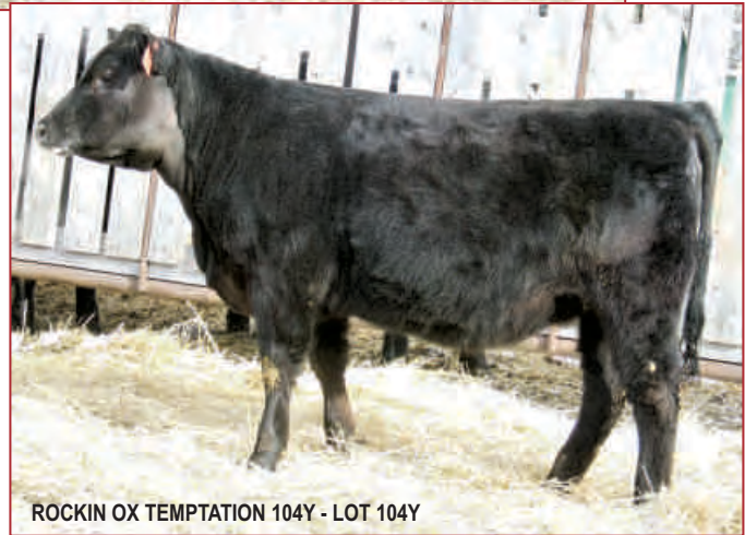
ROCKIN OX TEMPTATION 104Y - LOT 104Y