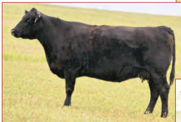
EASTONDALE ENCHANTRESS 54'05 DAM OF LOT 68Y