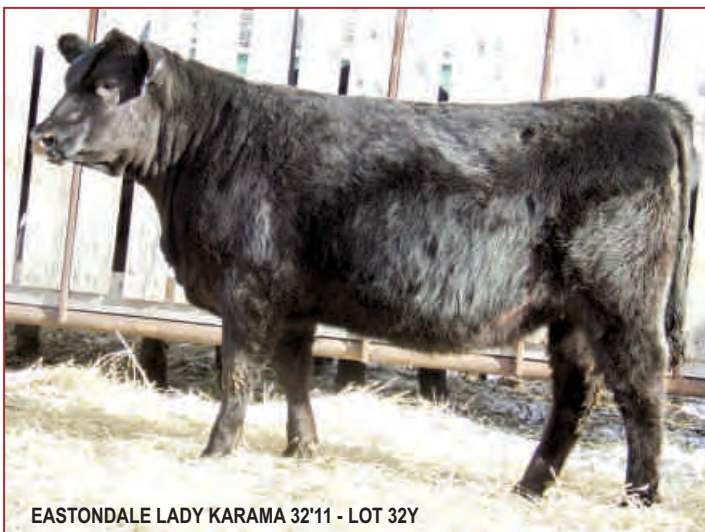
EASTONDALE LADY KARAMA 32'11 - LOT 32Y