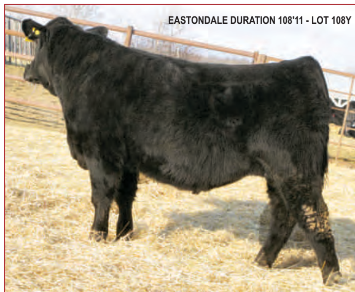
EASTONDALE DURATION 108'11 - LOT 108Y