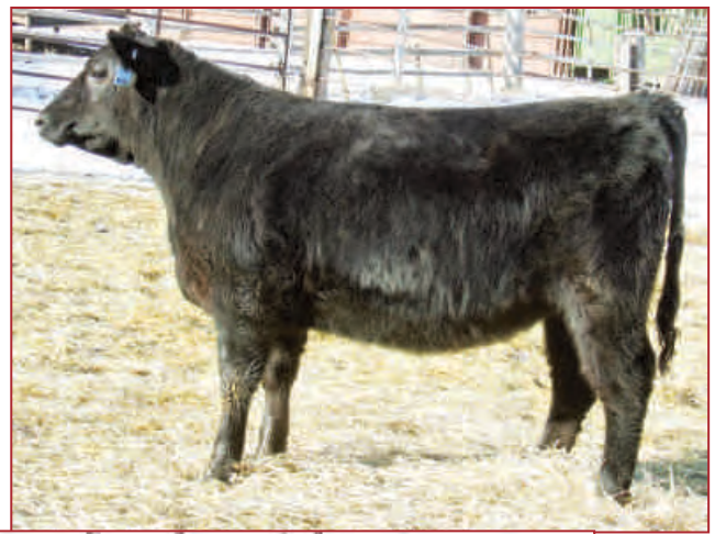
EASTONDALE SANDA ROSE 96'11 LOT 96Y