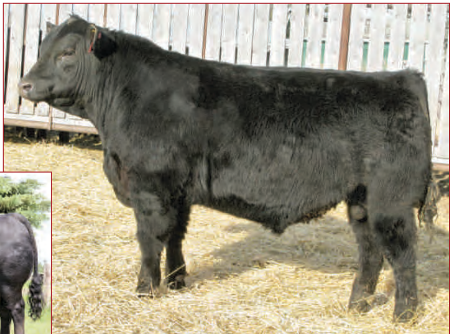
ROCKIN OX SNEEKY PETE 103Y - LOT 103Y