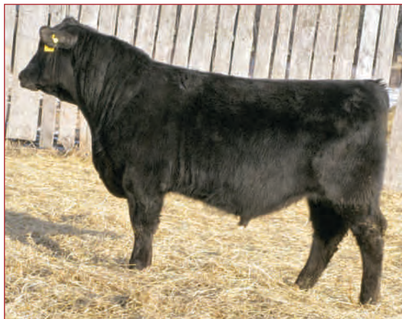
OAKWOOD RIGHT TIME 3Y - LOT 3Y