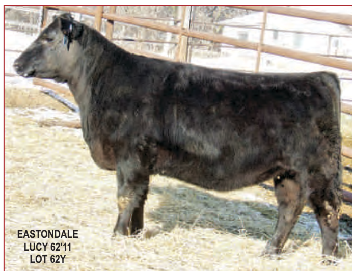
EASTONDALE LUCY 62'11 LOT 62Y