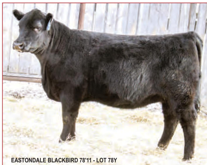
EASTONDALE BLACKBIRD 78'11 - LOT 78Y