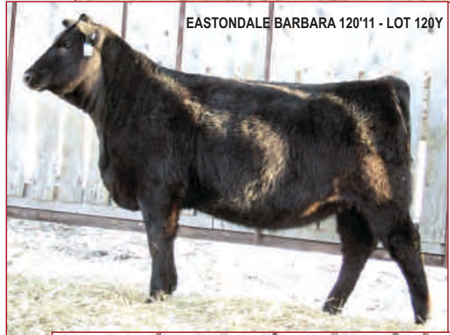
EASTONDALE BARBARA 120'11 - LOT 120Y