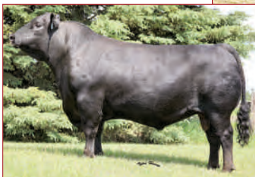
EASTONDALE BREAK AWAY 32'07 - SIRE OF LOT 103Y